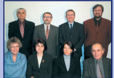
FLGR Board of Directors:

FLGR ENSURES ITS SUSTAINABILITY BY CONSTANTLY IMPROVING ITS TEAM'S PROFESSIONAL SKILLS, STRIVING TO DIVERSIFY FINANCIAL SUPPORT, LOOKING FOR NEW INTERNATIONAL PARTNERSHIPS AND INCREASING THE SHARE OF PAID SERVICES