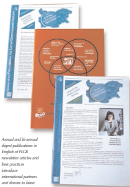
Annual and bi-annual digest publications in English of FLGR newsletter articles and best practices introduce international partners and donors to latest developments in Bulgarian local self-government and civil society

New and most demanded titles among the books, manuals and brochures published by FLGR during the period were: 'How to Implement the Access to Information Act';