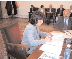
Signing of a Memorandum of Cooperation between FLGR and the Committee on Local Self-Government, Regional Policy and Public Works at the 38th National Assembly

T hrough various specific initiatives, five discussion fora and two topical publications, in 2001 FLGR increased its serious contribution to the development of new political culture based on cooperation and dialogue with local authorities and their organizations and with central legislative and executive authorities.