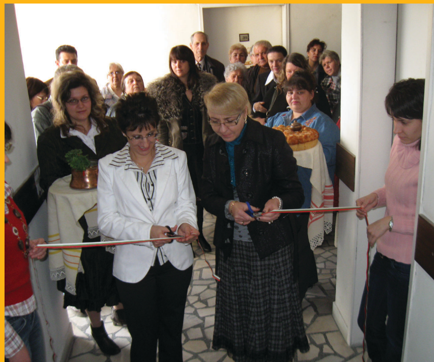
Opening of the Centre for Social Rehabilitation – Silistra, December 2, 2009

In February 2009 the evaluation of the 321 project proposals submitted for the first call was completed and the projects were approved to be financially supported as follows: